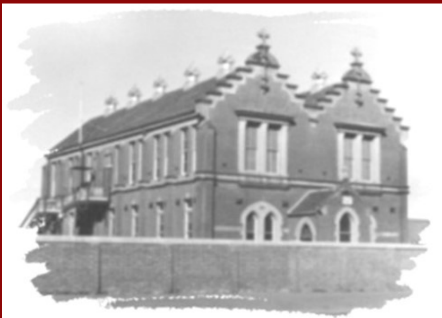
ST ALIPIUS GIRLS' SCHOOL CIRCA 1912

Our school evolved during the time of the Eureka uprising, with numerous parents of pupils apparently involved in Australia's only politically motivated civil uprising. It was a time of passion and struggle and commitment to a cause. These qualities continue to inspire us as we strive for excellence in educational outcomes for all our students within a culture of authentic Catholic community.